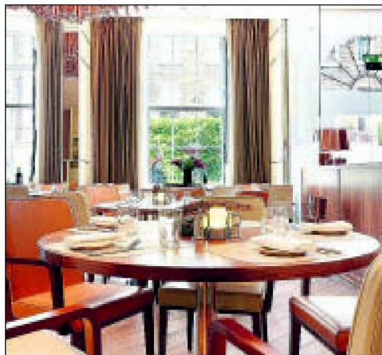
■ EYE-CATCHING: The stylish interior of Sixtyone is attractive to diners

I hope the endearing couple we sat next to from Welwyn Garden City, and with whom we struck up an interesting conversation during the course of the evening, enjoyed the rest of their meal – they were certainly well on the way to being Sixtyone converts by the time we left.