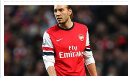
Overreaction Theatre: Messi + Ronaldo + Suarez = BENDTNER! Early Doors - 3 hours ago