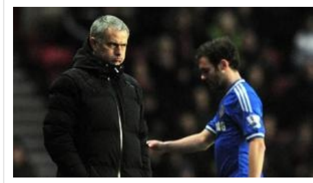
Premier League - Paper Round: Mourinho puts United on red alert over Mata