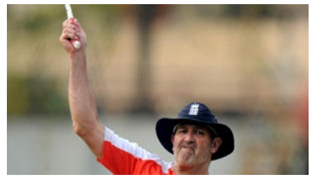
Sacking Gooch is not the answer for beleaguered England Cow Comer - 1 hour 25 minutes ago