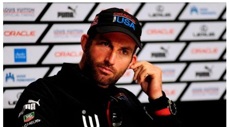
Eurosport - UNITED STATES, San Francisco : Helmsman Sir Ben Ainslie reacts during a media conference after Oracle Team USA won the 34th America's Cup on September 25, 2013 in San Francisco.